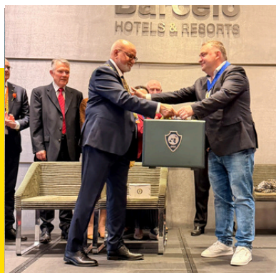
THANKS from the ASE President 2025-26