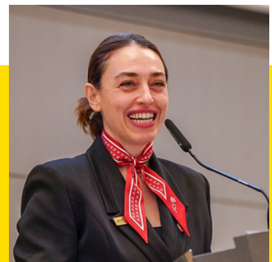
European candidate for President 2027