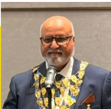
WORD from THE ASE president 2026-27